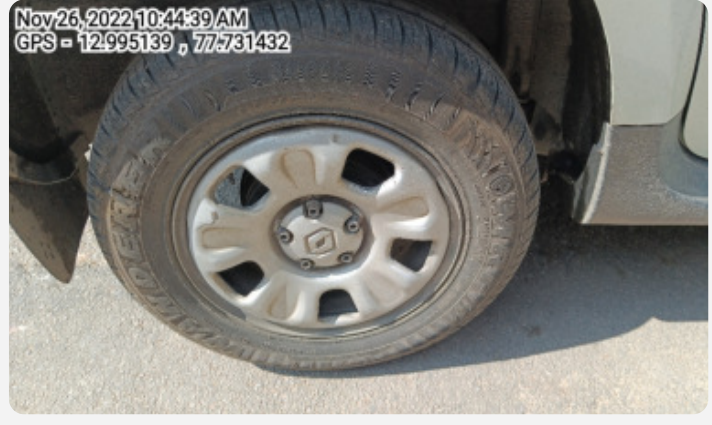
Nov 26, 2022 10:44:39 AM