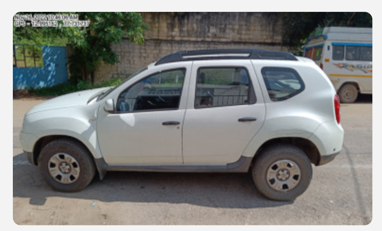
Nov 26, 2022 10:46:06 AM