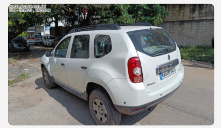
Nov 26, 2022 10:45:47 AM