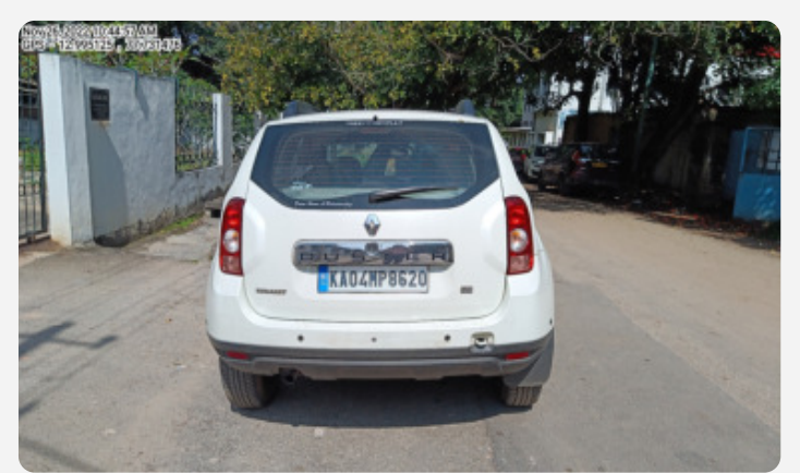
Nov 26, 2022 10:44:57 AM