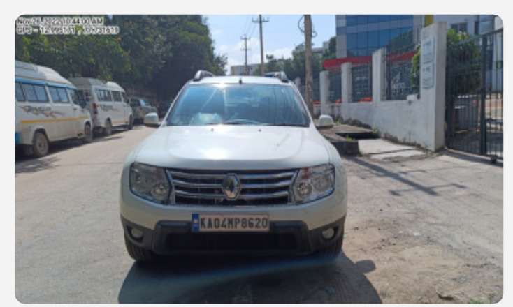
Nov 26, 2022 10:44:00 AM