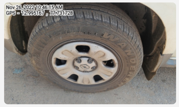
Nov 26, 2022 10:46:15 AM