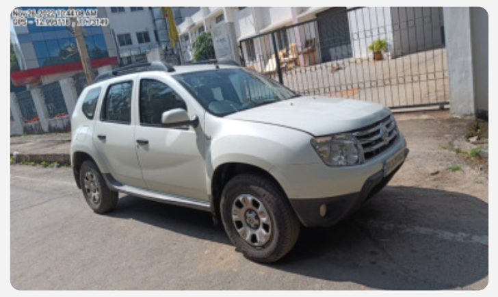
Nov 26, 2022 10:44:08 AM