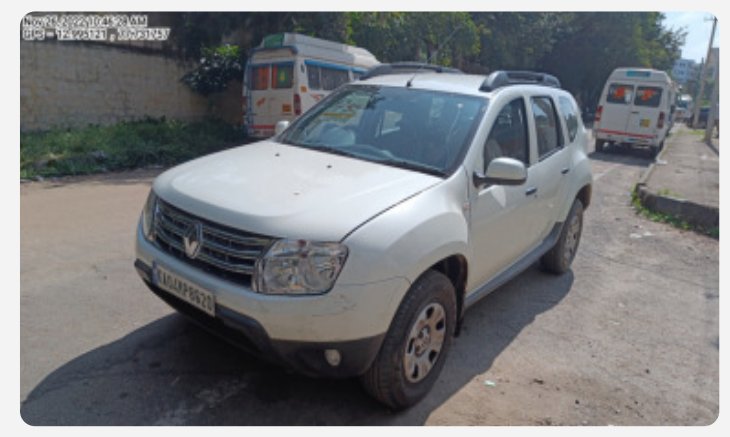
Front Left Side