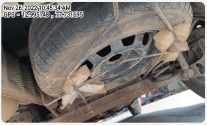
Nov 26, 2022 10:45:34 AM