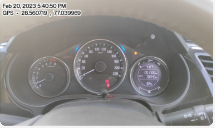
Feb 20, 2023 5:40:50 PM