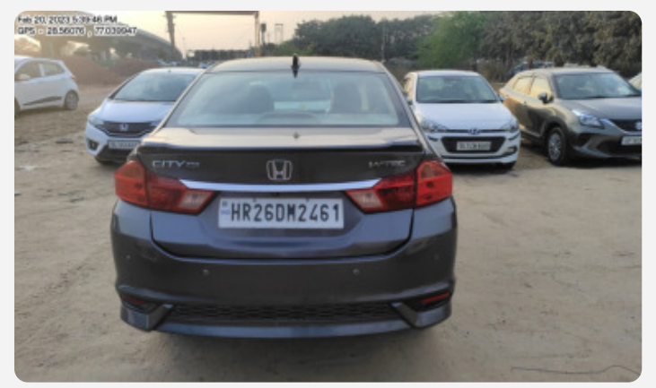
Feb 20, 2023 5:39:46 PM