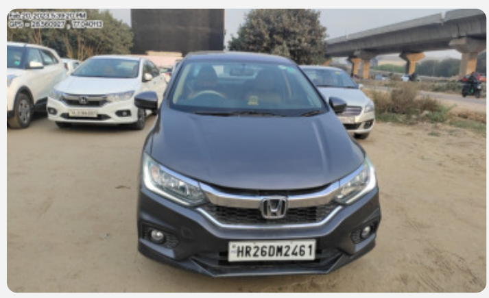
Feb 20, 2023 5:39:20 PM