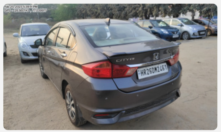
Feb 20, 2023 5:39:51 PM