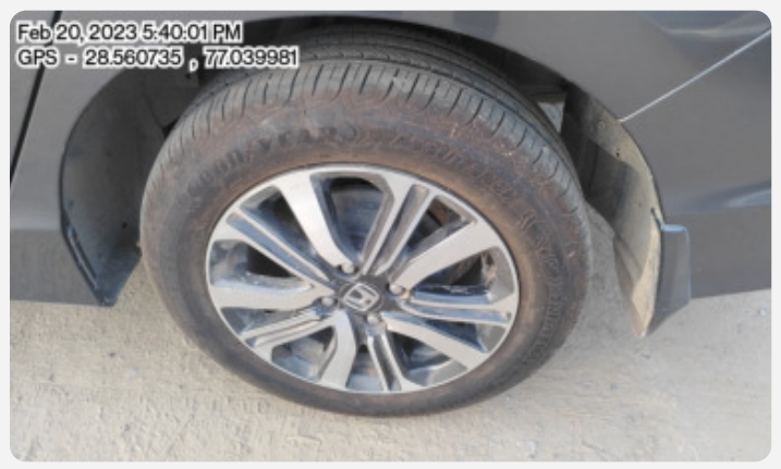
Feb 20, 2023 5:40:01 PM