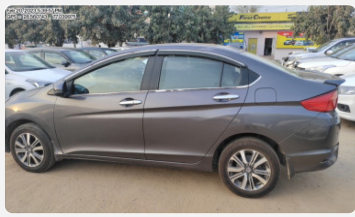
Feb 20, 2023 5:39:57 PM