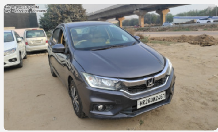
Feb 20, 2023 5:39:24 PM