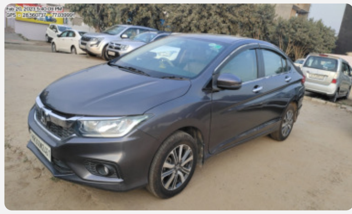
Feb 20, 2023 5:40:09 PM