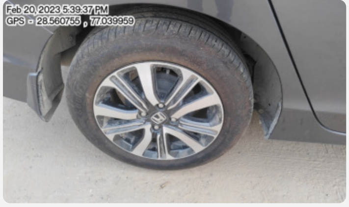
Feb 20, 2023 5:39:37 PM