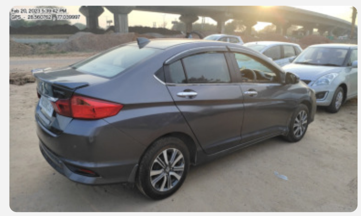
Feb 20, 2023 5:39:42 PM