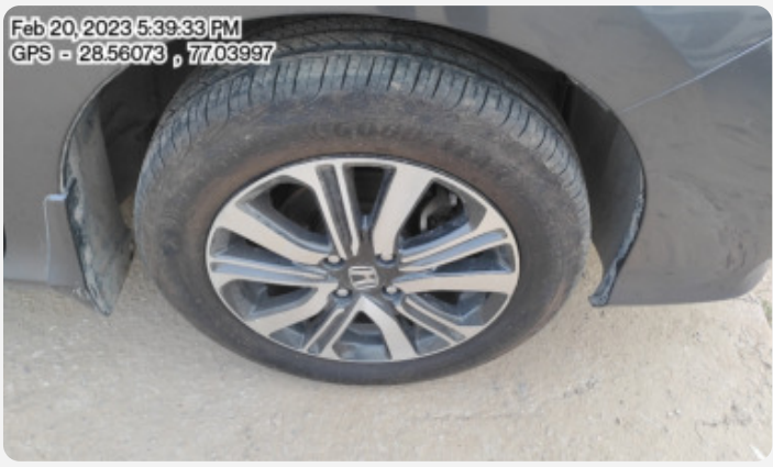
Feb 20, 2023 5:39:33 PM