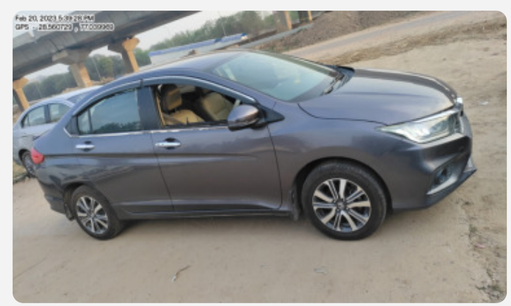
Feb 20, 2023 5:39:28 PM