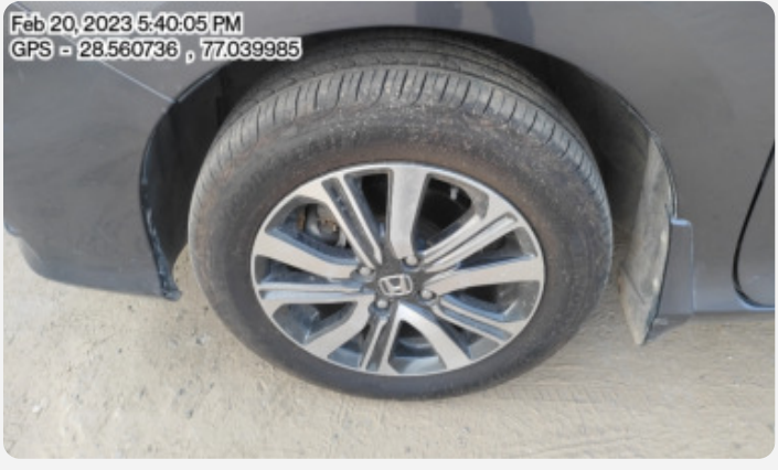
Feb 20, 2023 5:40:05 PM