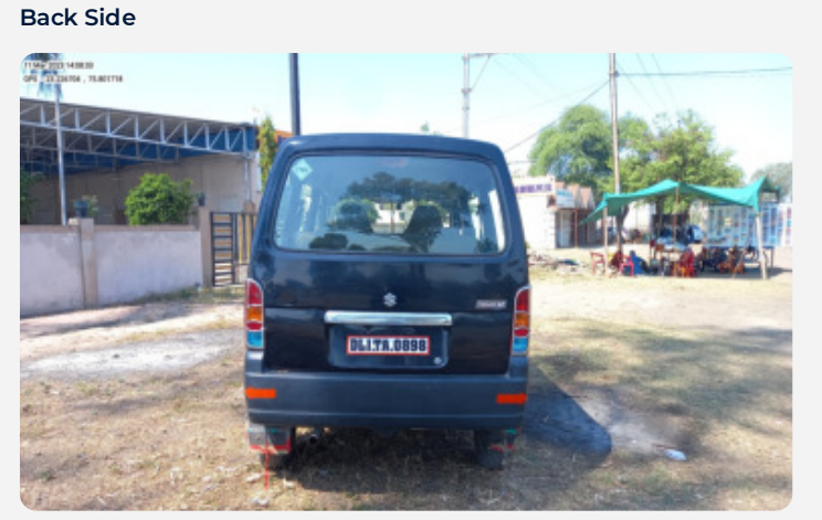
11 Mar 2023 14:08:33