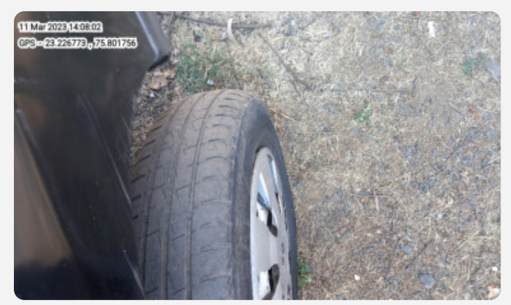
11 Mar 2023 14:08:02