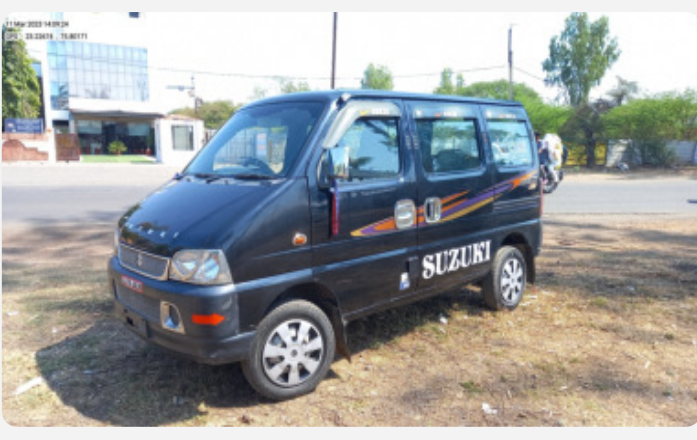
11 Mar 2023 14:09:24