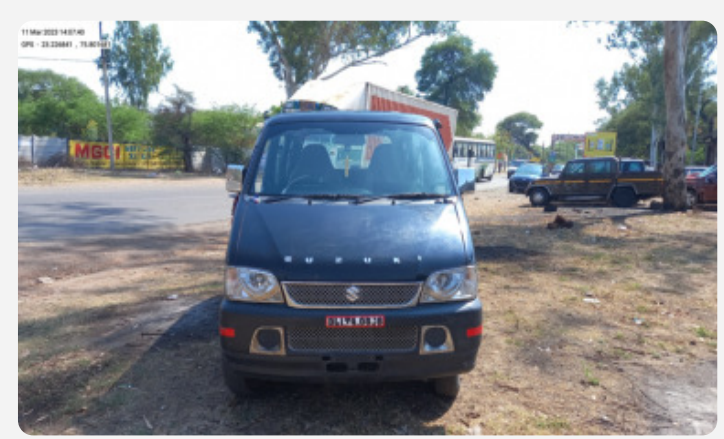
11 Mar 2023 14:07:40