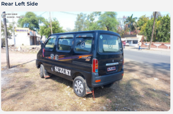
11 Mar 2023 14:08:43