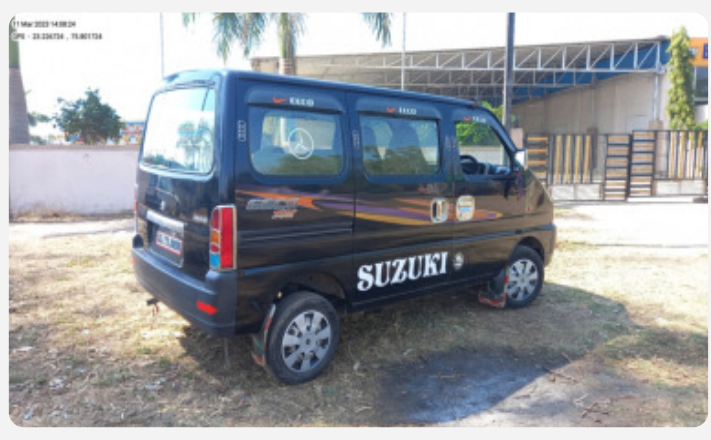
11 Mar 2023 14:08:24