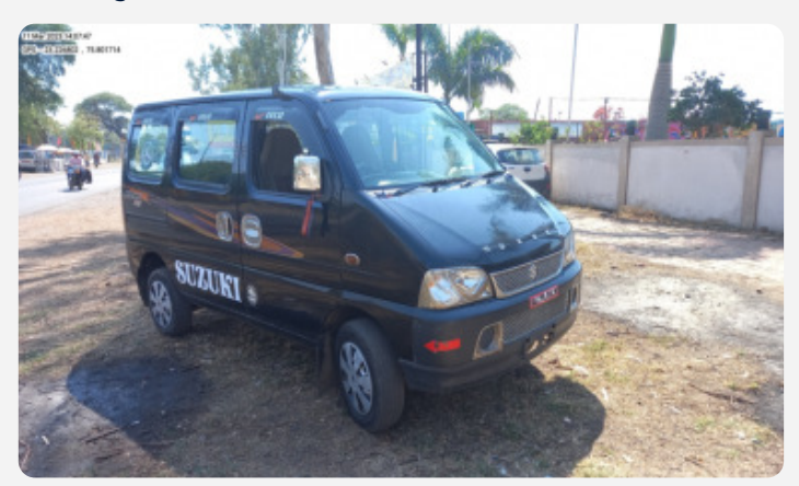
11 Mar 2023 14:07:47