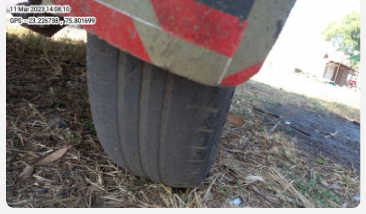
11 Mar 2023 14:08:10