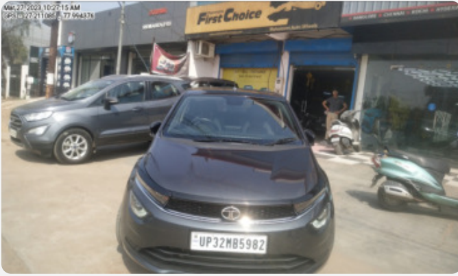
Mar 27, 2023 10:27:15 AM