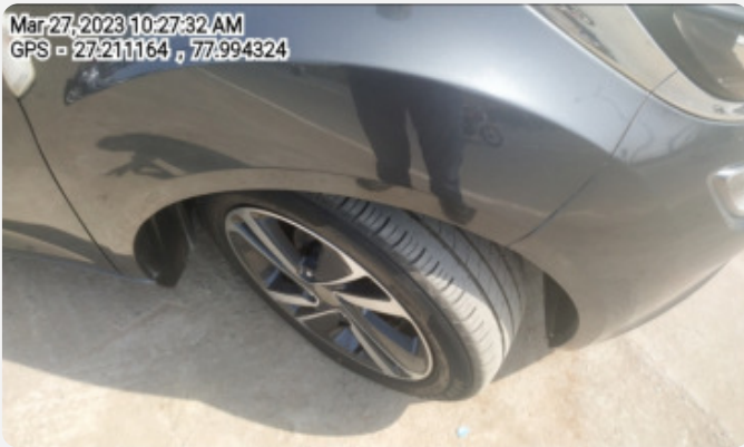
Mar 27, 2023 10:27:32 AM