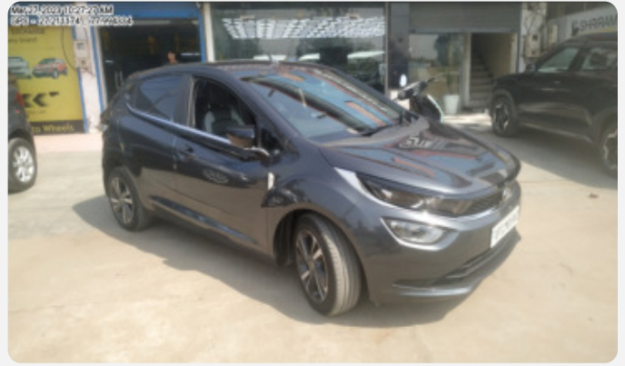
Mar 27, 2023 10:27:27 AM