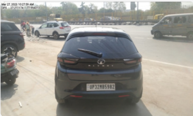
Mar 27, 2023 10:27:59 AM