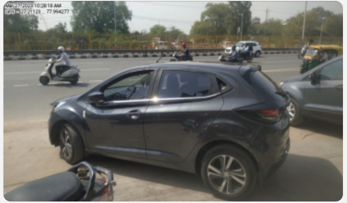
Mar 27, 2023 10:28:18 AM