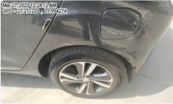
Mar 27, 2023 10:28:12 AM