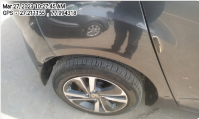
Mar 27, 2023 10:27:45 AM