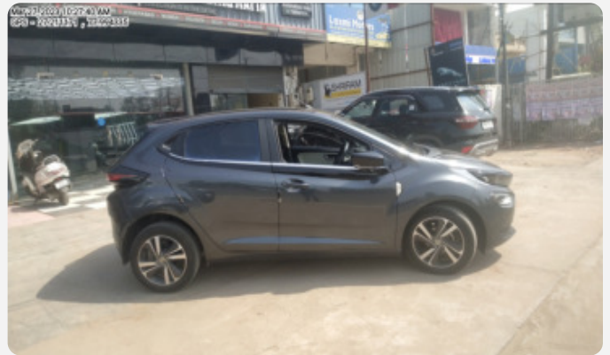
Mar 27, 2023 10:27:40 AM