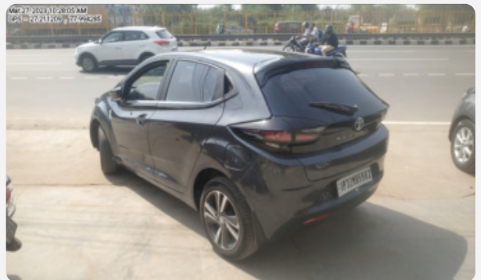
Mar 27, 2023 10:28:05 AM