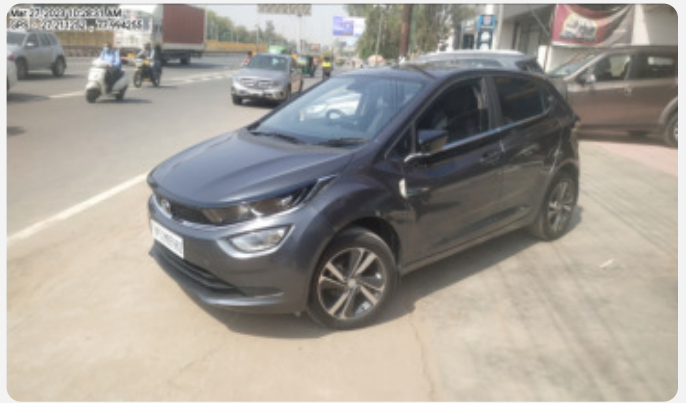
Mar 27, 2023 10:28:31 AM