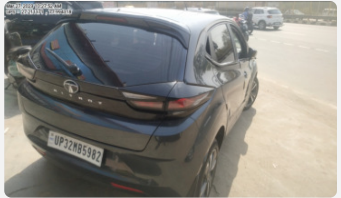
Mar 27, 2023 10:27:52 AM