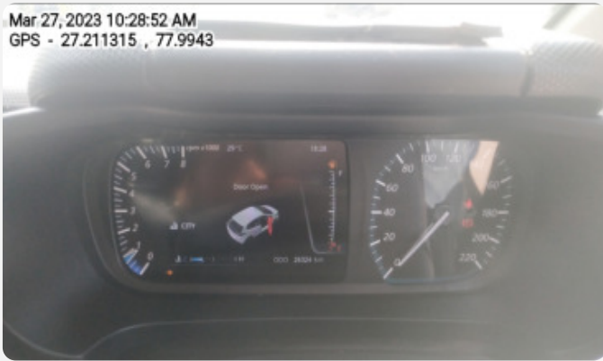
Mar 27, 2023 10:28:52 AM