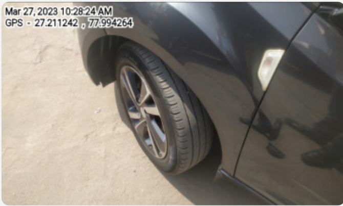
Mar 27, 2023 10:28:24 AM