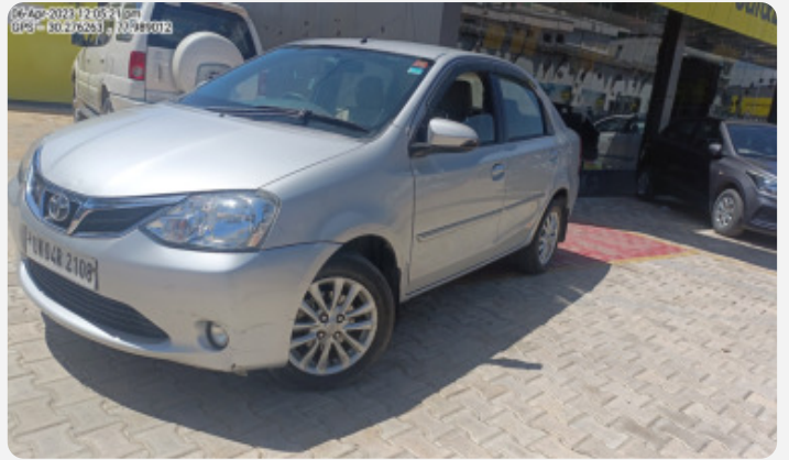
06-Apr-2023 12:05:21 pm