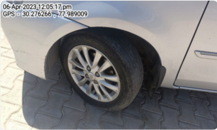
06-Apr-2023 12:05:17 pm