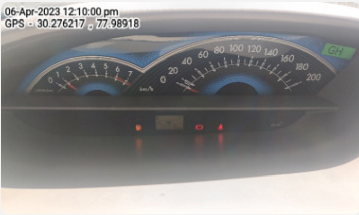
06-Apr-2023 12:10:00 pm