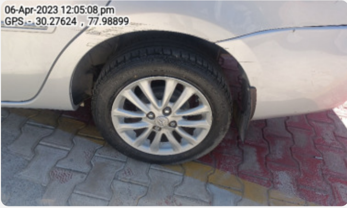
06-Apr-2023 12:05:08 pm