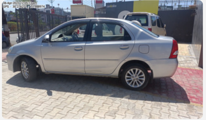
06-Apr-2023 12:05:13 pm