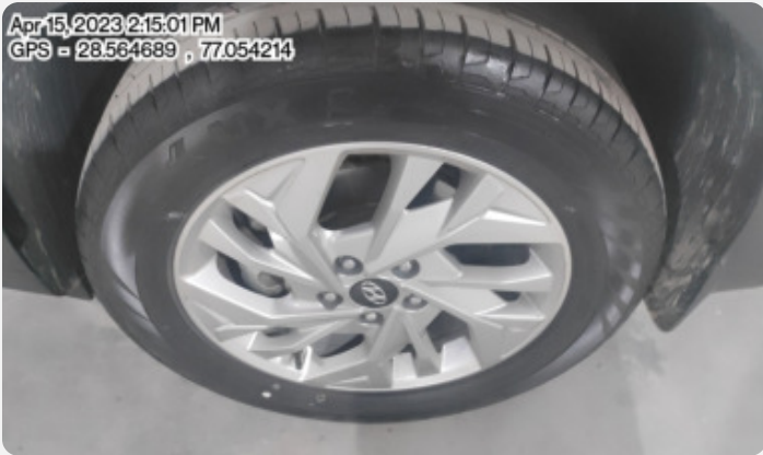
Apr 15, 2023 2:15:01 PM