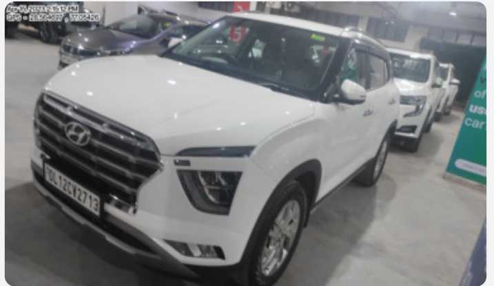
Apr 15, 2023 2:15:12 PM