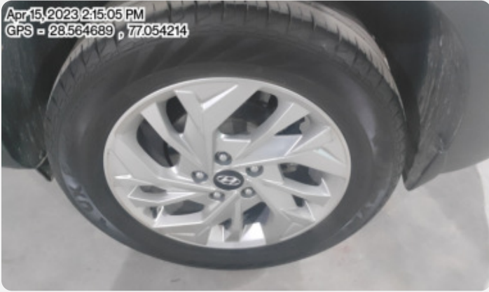
Apr 15, 2023 2:15:05 PM