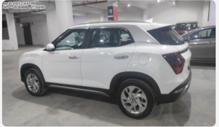
Apr 15, 2023 2:14:53 PM