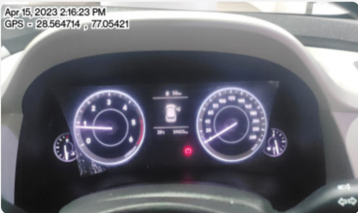
Apr 15, 2023 2:16:23 PM