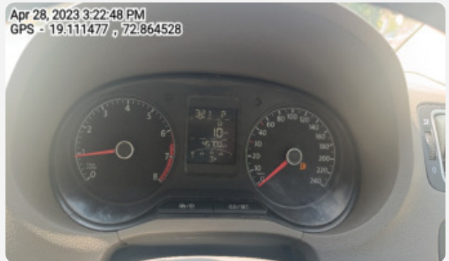
Apr 28, 2023 3:22:48 PM