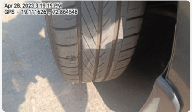
Apr 28, 2023 3:19:19 PM