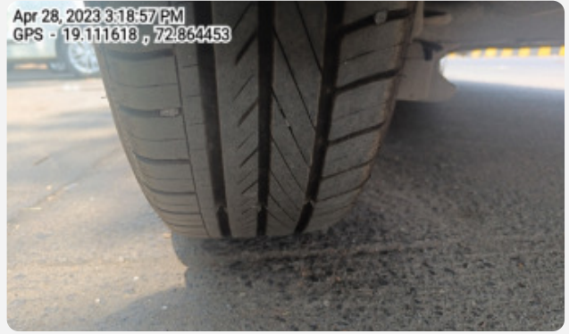
Apr 28, 2023 3:18:57 PM