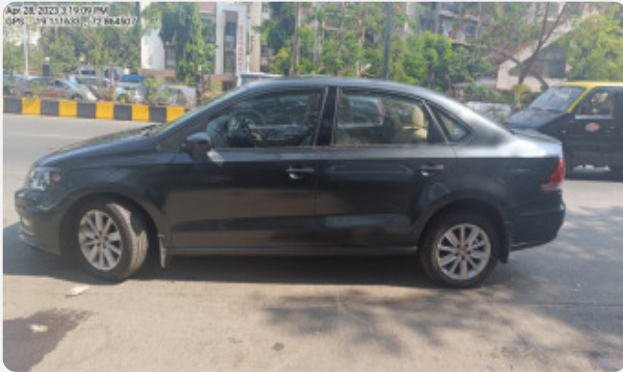
Apr 28, 2023 3:19:09 PM