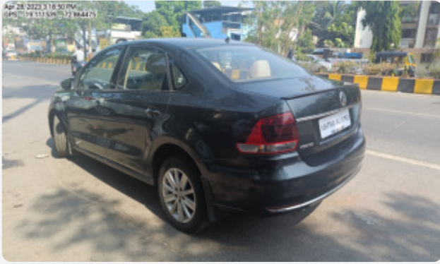
Apr 28, 2023 3:18:50 PM