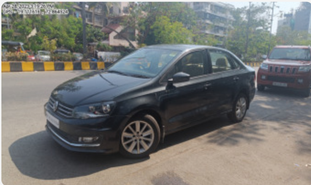
Apr 28, 2023 3:19:26 PM