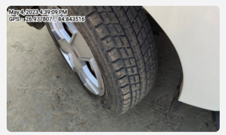
Front Left Tyre