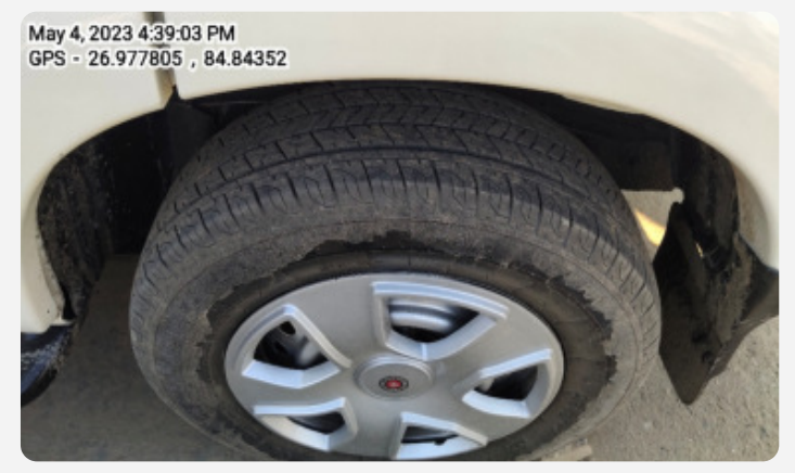
May 4, 2023 4:39:03 PM