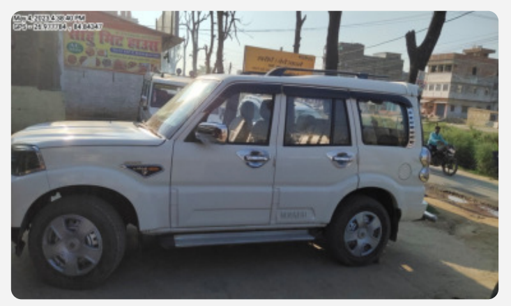
May 4, 2023 4:38:40 PM