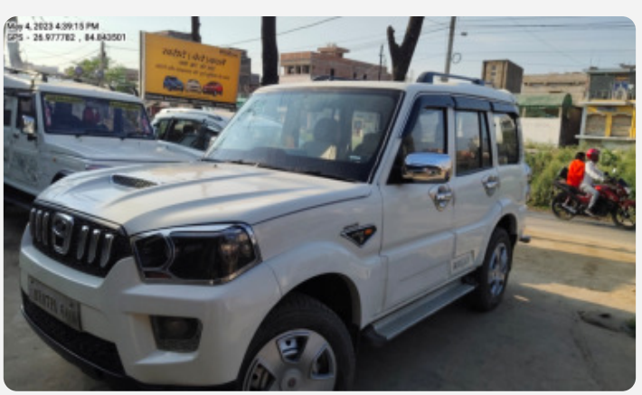
May 4, 2023 4:39:15 PM