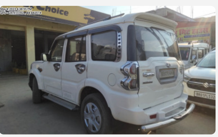
May 4, 2023 4:38:55 PM