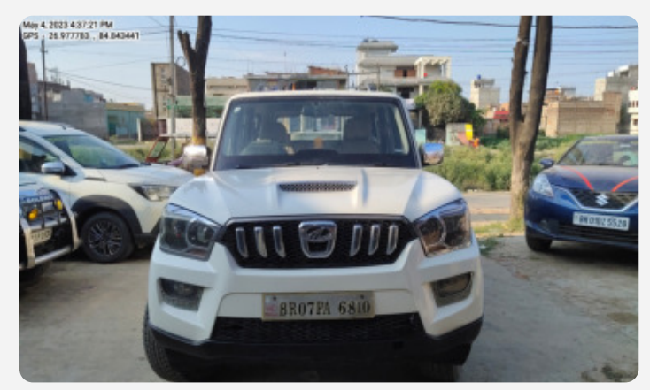
May 4, 2023 4:37:21 PM