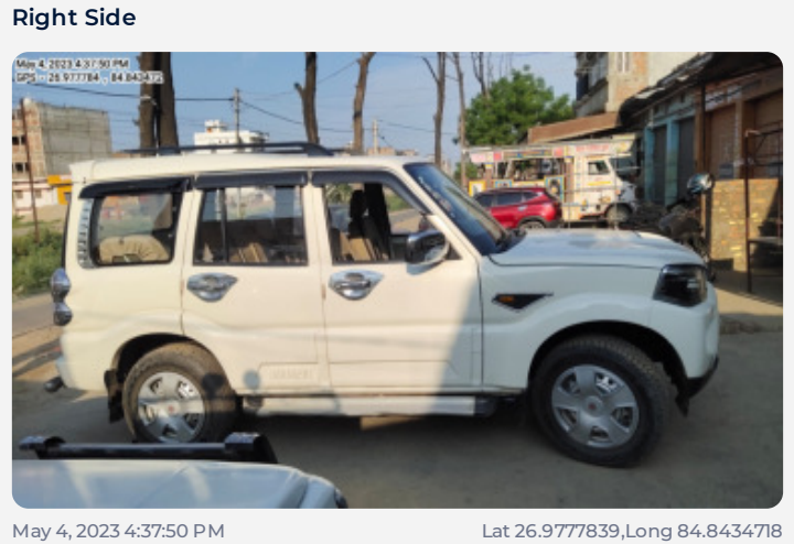
May 4, 2023 4:37:50 PM