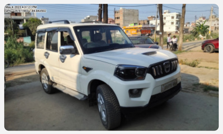
May 4, 2023 4:37:27 PM