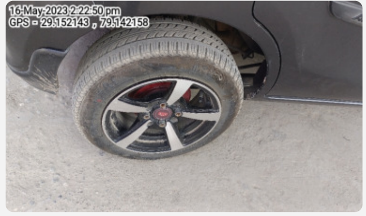
16-May-2023 2:22:50 pm