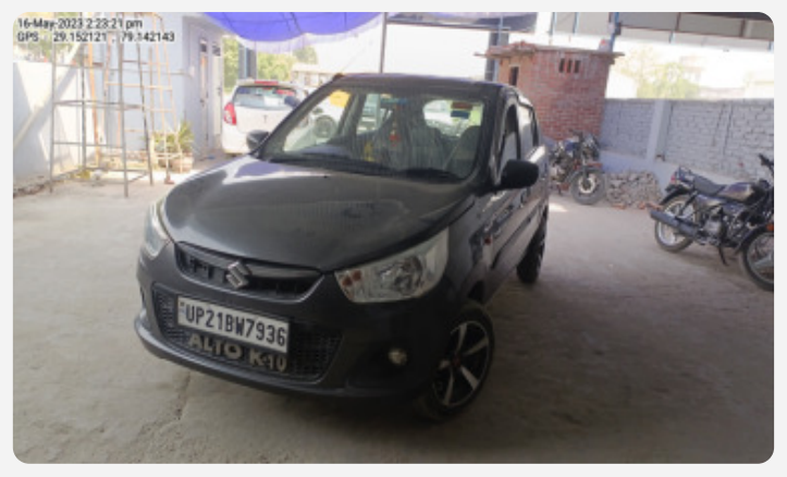
16-May-2023 2:23:21 pm