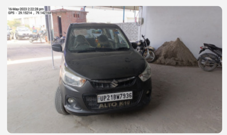
16-May-2023 2:22:28 pm