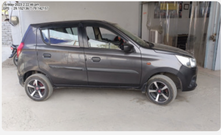
16-May-2023 2:22:46 pm