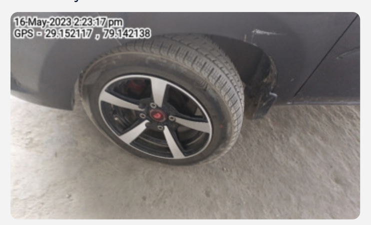
16-May-2023 2:23:17 pm