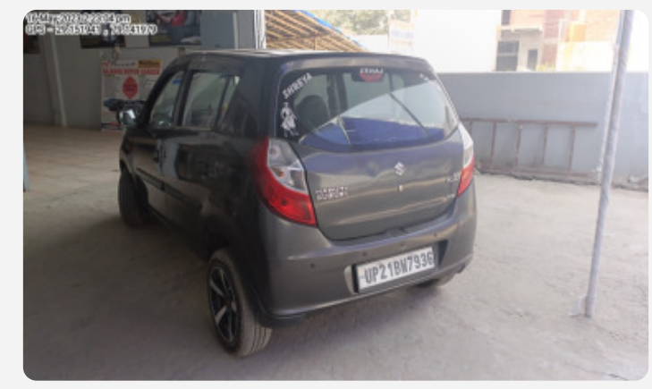
16-May-2023 2:23:04 pm