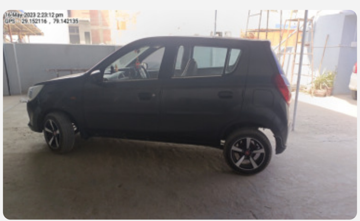
16-May-2023 2:23:12 pm