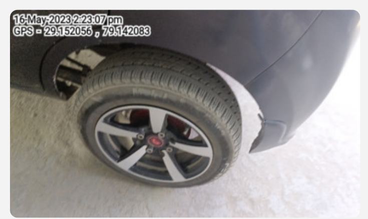
16-May-2023 2:23:07 pm