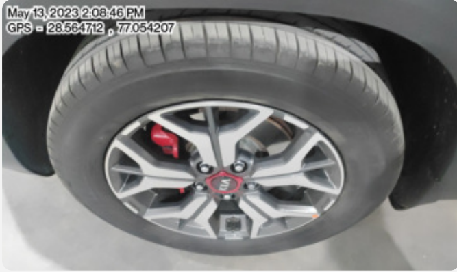
May 13, 2023 2:08:46 PM