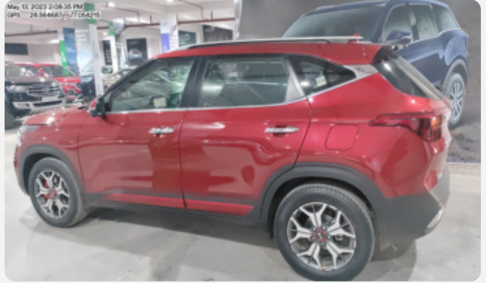
May 13, 2023 2:08:35 PM