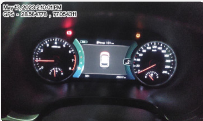
May 13, 2023 2:10:01 PM