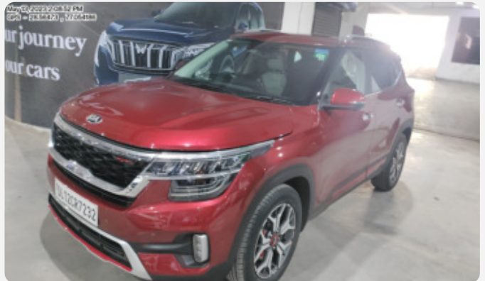
May 13, 2023 2:08:52 PM