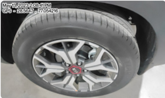
May 13, 2023 2:08:41 PM